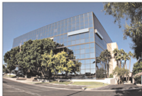
120 North 44th Street Phoenix, AZ