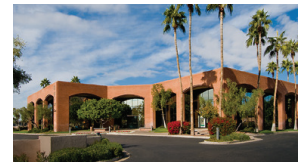
4040 4040 E Camelback Rd Phoenix, AZ 85018