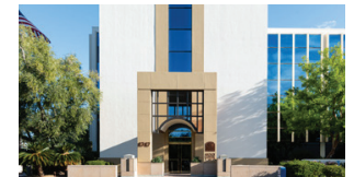
4747 4747 N 22nd St Phoenix, AZ 85016