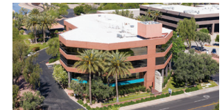
7250 7250 N 16th St Phoenix, AZ 85020