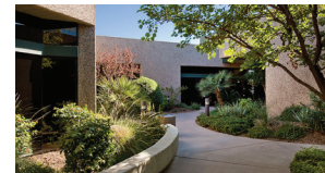
SOP 3923-4041 S McClintock Rd Tempe, AZ 85282