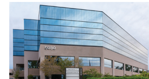
5080 5080 N 40th St Phoenix, AZ 85018